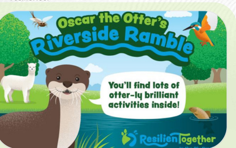
Figure 4. Front cover of the Riverside Ramble activity booklet

As well as being a tool to share information, Hello Lamp Post technology can gather real time data from the community. ResilienTogether gains monthly insights into the effectiveness of the engagement tool via monthly statistics on interaction at each sign location. This includes the number of people who have used the Ramble, the number of user messages, the percentage of questions answered correctly and the most popular locations. This data is being used to better understand public perceptions, engagement and community resilience.