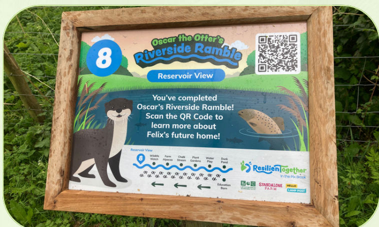
Figure 2. Riverside Ramble sign for the Reservoir View location